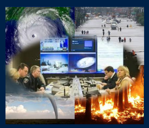
Organization Resiliency & Sustainability